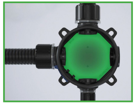
Maximum internal wiring space - no protruding threads or locknuts