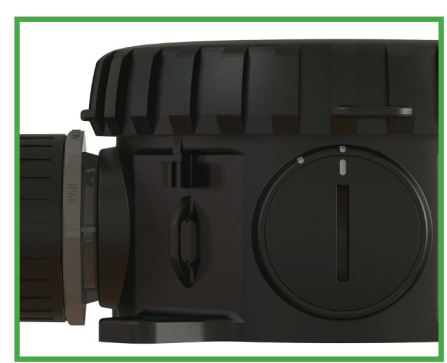
Blank off unused outlets